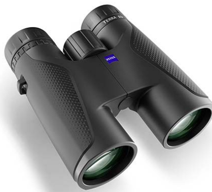
Zeiss Terra 10X42 Binocular