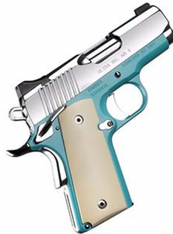
Kimber Ultra Bel Air II 9mm