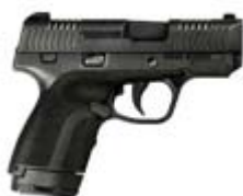
Honor Defense 9mm