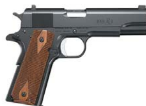
Remington R1 1911 .45acp