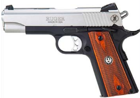
Ruger SR1911 .45acp