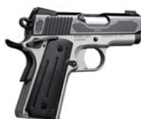
Kimber Onyx Ultra Carry II .45acp