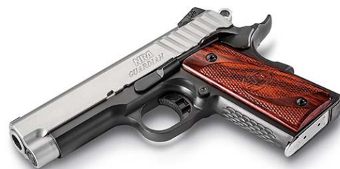
STI Gaurdian 1911 9mm w/NRA logo