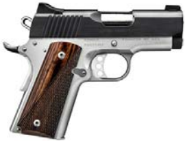
Kimber Ultra Carry II .45