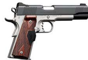
Kimber Crimson Custom II .45