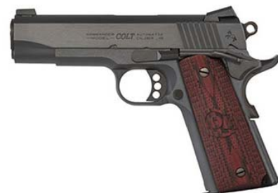
Colt Commander 1911 .45