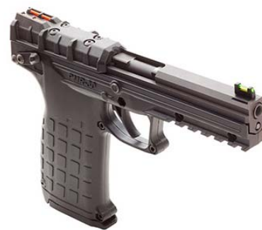
Kel-Tec PMR-30 .22 mag.