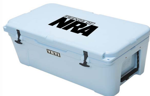
Yeti Tundra 50qt or 65qt Cooler