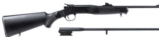
Rossi Matched Pair .410/.22LR