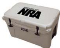
Yeti Tundra 45qt (allow 45days)