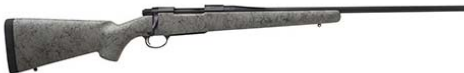
Nosler M48 .30 Nosler Caliber