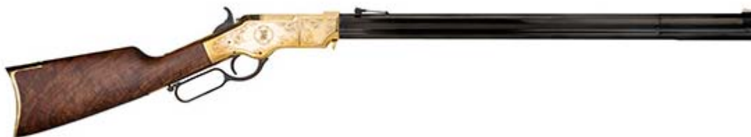
Henry Original 44-40NRA Edition