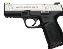
Smith & Wesson SD9 VE 9mm

Choice of One Incentive Includes 4 Tickets on the Kimber Drawing!