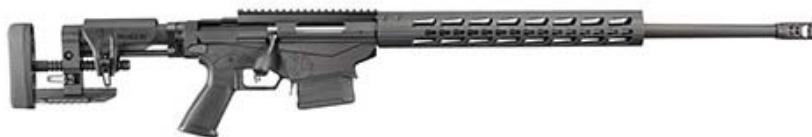
Ruger Enhanced Precision Rifle 6.5 CD