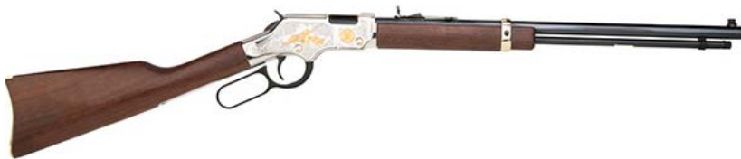
Henry 2 Amendment Tribute Edition Golden Boy .22