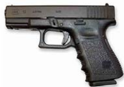
Glock Model 19 9mm