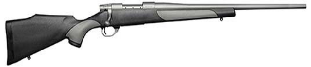
Weatherby Vanguard .270