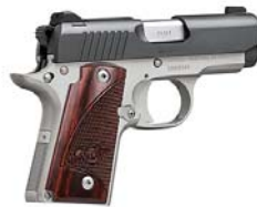
Kimber Micro 9mm