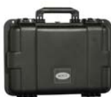
Boyt H-Series Double Pistol Case