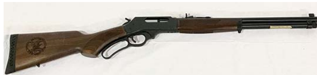
Henry Big Steel 45-70 NRA logoed