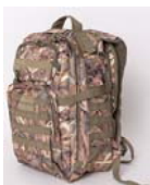
Yukon Outfitters-Alpha Back Pack