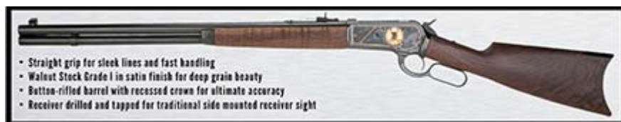
Winchester 1886 45-70 NRA Edition