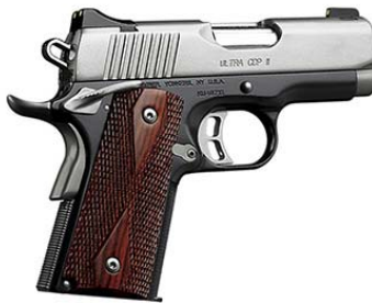
Kimber Ultra CDP II .45