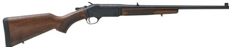
Henry Single Shot .243win.

4-Dinner Tickets & Choice of Once Incentive Include 4 tickets on the Kimber drawing.