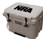
20 QT Yeti Cooler