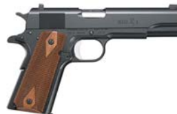
Remington R1 1911 .45