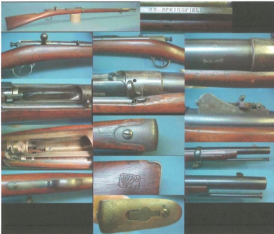
Figure 3. U.S. Model 1882 Chaffee Reese Bolt Action Magazine Rifle

provided a significant improvement over the model 1873 Trapdoor Springfield. The Chaffee-Reese was the first bolt action repeating rifle manufactured entirely at Springfield Armory although they assembled some of the Winchester Hotchkiss rifles with parts produced by both the Armory and Winchester. 23