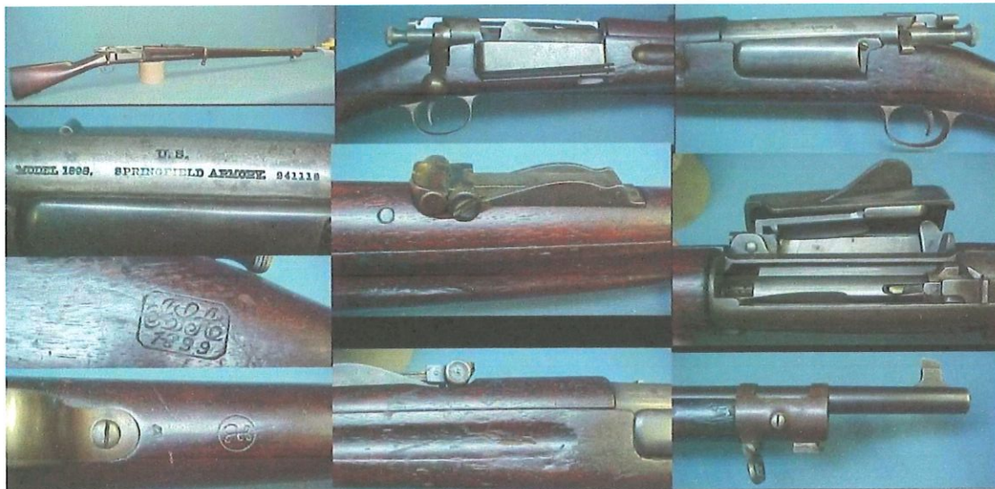
Figure 4. U.S. Model 1898 Krag Rifle Photographs by John Spangler

Lee, Savage, Durst, Blake, Russell-Livermore, White, and Hampden submitted either the same rifles, or modified versions of those submitted for the original board. Francis Bannermann, who was one of the post-Civil War arms dealers who purchased a great deal of surplus arms and equipment during the period, only submitted the Spencer-Lee for the 1893 Board for Testing Magazine Rifles of American Invention.