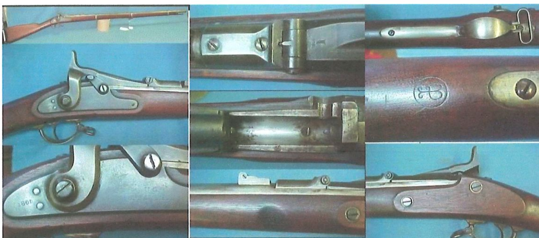
Figure 1. Model 1866 Springfield "Second Allin" Conversion

The conversion process involved reaming the original barrels to remove the rifling and brazing 15 in a .50-caliber liner. The Armory milled away the rear portion of the barrel for the hinged Allin breechblock. The Allin breechblock and hinge assembly were case hardened while the rear sight and trigger assemblies remained blued, and the rifle retained the bright or unfinished barrel. The original stock required alteration to provide clearance for the extractor and ejector mechanisms. The Model 1866 chambered the .50-70 also called the .50-70-450 cartridge. The cartridge designation is composed of the bullet diameter (.50-caliber), the powder charge (70 grains of black powder) and the bullet weight (450-grains). Despite a new extraction system employed on the Model 1866 which replaced the problematic ratchet extractor of the Model 1865, case extraction continued to be a problem and frequently resulted in the expended copper shell casing remaining lodged in the chamber after firing, which disabled the weapon.